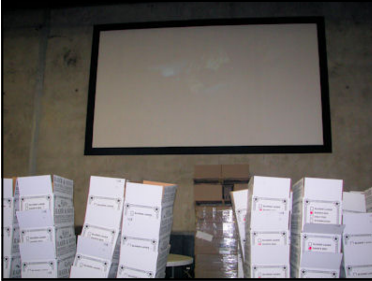
16' x 9' projection screen