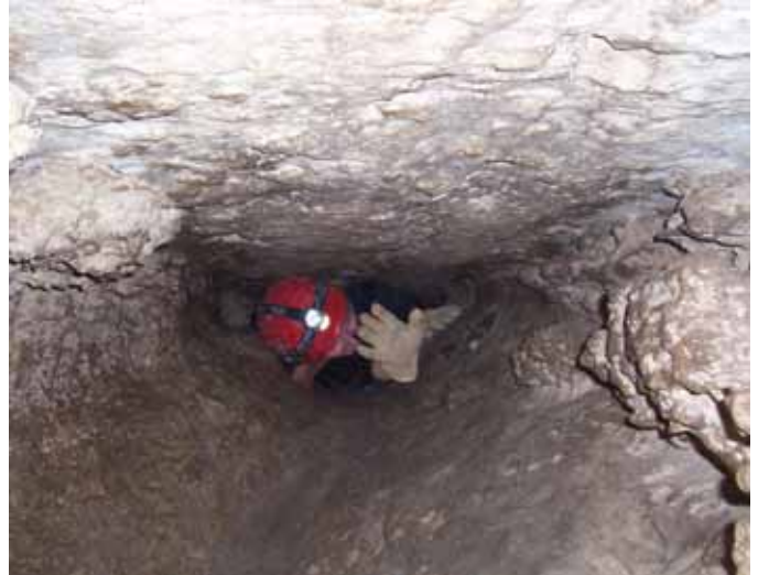
Cynthia Hall making her way through the key hole

The keyhole (entrance to the cave) is solid rock so there's no give or dirt or rocks to move out of the way to make more room. You just have to make yourself as small as possible and push through. Your arms are pretty useless because of the way you have to tuck them to get through so your feet do most of the work. Though the tunnel is approximately 20 feet long the really tight squeeze is only about 2 ½ or 3 feet of it. Once you're through you squirt out into a space that is large enough to sit up in and take a breather.