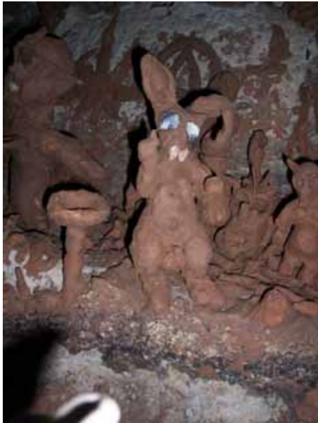
Art Gallerie creations