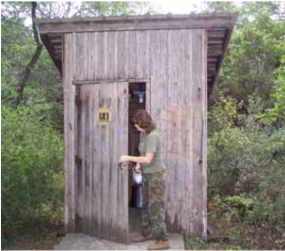
Tammy Cox taking advantage of the last potty stop for a while.

park since we were afraid they would close the gates and we'd be locked in until the next morning. Gear on, water in hand for hike to the cave, last potty stop and we were off with a bit of an adrenaline rush. In years that are not so hot and dry there is water in the creek for swimming and fishing, but this year there wasn't a drop so we hiked down the creek bed as far as we could before we had to go up the hill to the cave entrance. The creek bed was a more level straight shot than hiking up and down the sides of the hill to the cave. The park was full of people biking, rock climbing, hiking and walking the dog. What a fun and busy place!