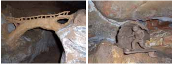
More cave art