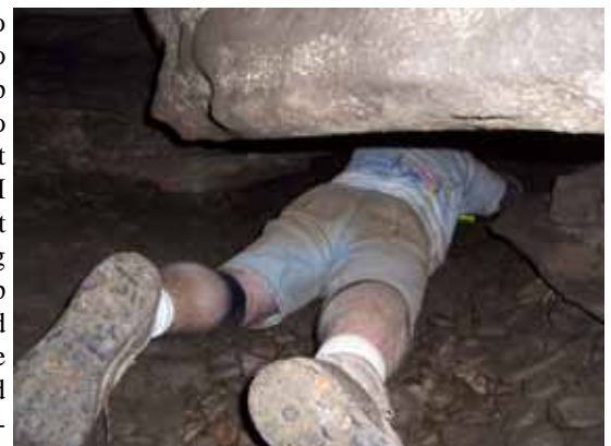
Ed Malcom crawling through the stream passage to the bottom of Cave Mountain

push them to one side to open it up enough to make it through. I went in first with a big plastic scoop that Milo had armed me with and started pushing rocks out of the way. After about twenty minutes of pushing rocks and squeezing through we made it to the bottom of the cave.