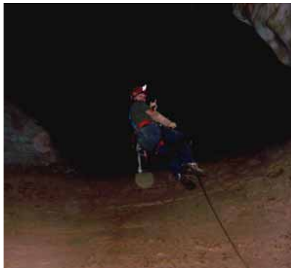
Cynthia Hall on rope at Cave Mountain