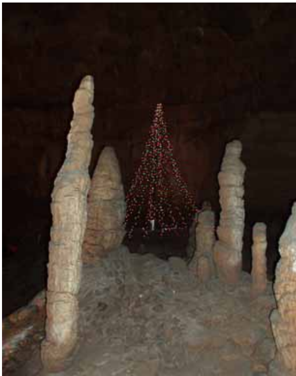
Christmas lights at Cave Without A Name

CWAN has lots of great formations, and the tour guide was informative and entertaining. I was impressed with the size of the main room, which I thought was pretty big as far as Texas caves are concerned.