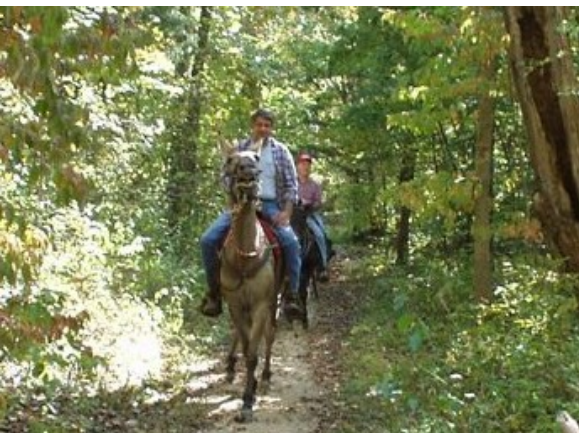
Guys on mules

The next day we headed out to go to a cave called Half Mile Cave. We traveled up an old logging road to the top of the hill where we parked. While we were putting on our caving gear three men came out of the thick woods riding mules. One of the mountain men's shirt was torn and the other one's ear was bleeding because they had been making their own riding trails. They asked what in the world we were doing and we told them we were fixing to