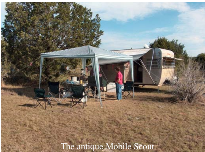
The antique Mobile Scout